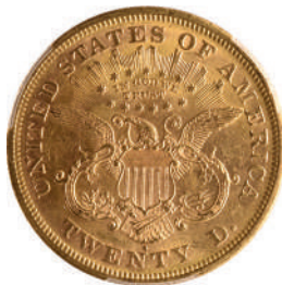
346 20 Dollars Liberty 1871 S, San Francisco . Liberty head left / Eagle. Fr. 175.