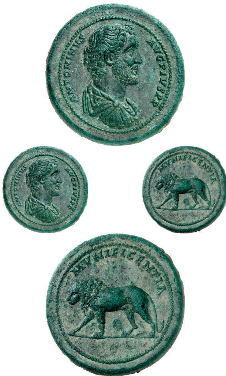
158 AE Medallion undated n. d. (circa 148). ANTONINVS AVG PIVS PP Draped bust right / MVNIFICENTIA Lion walking left. 45,71g. C. 562 var. (bust type and obverse inscription); Gnechi vol. II, p. 12-13, n° 31, Tav. 46, 5 var. (bust type and obverse inscription); Toynbee-; Dressel-; Tocci-.

A splendid specimen with beautiful green patina. 75'000.-