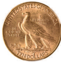
343 10 Dollars Indian 1911 S, San Francisco . Indian head left / Eagle left. Fr. 167.