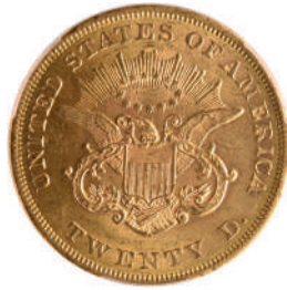
344 20 Dollars Liberty 1860. Liberty head left / Eagle. Fr. 169.