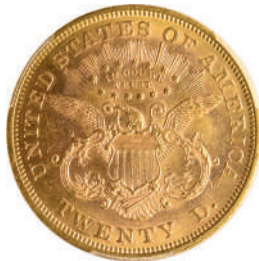
345 20 Dollars Liberty 1867. Liberty head left / Eagle. Fr. 174.